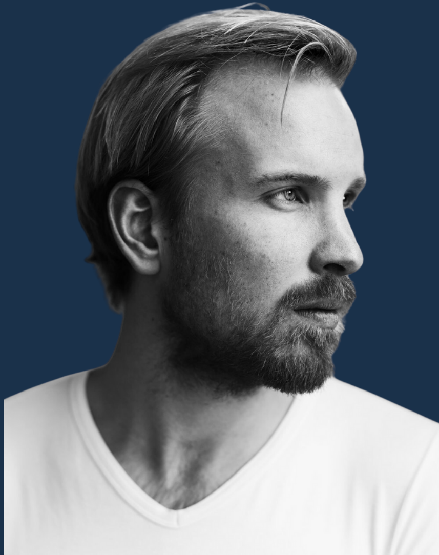
RUTGER BREGMAN HISTORIAN & AUTHOR