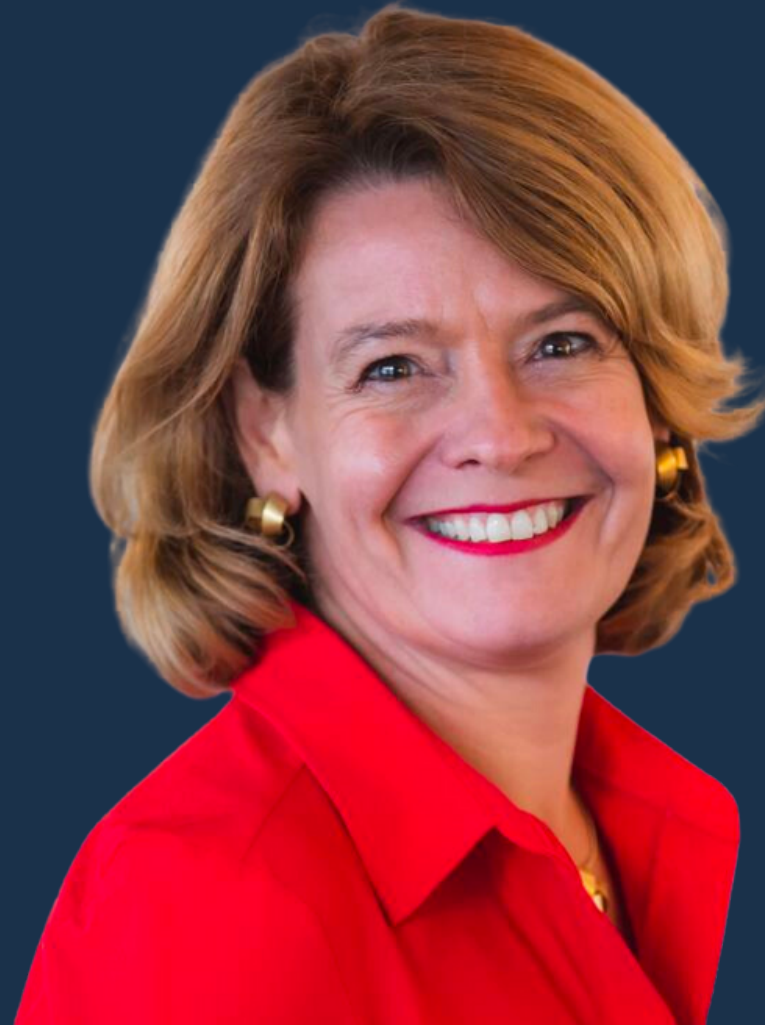
MEREL VAN VROONHOVEN EX BOARD ROOM EXECUTIVE & SENATOR)