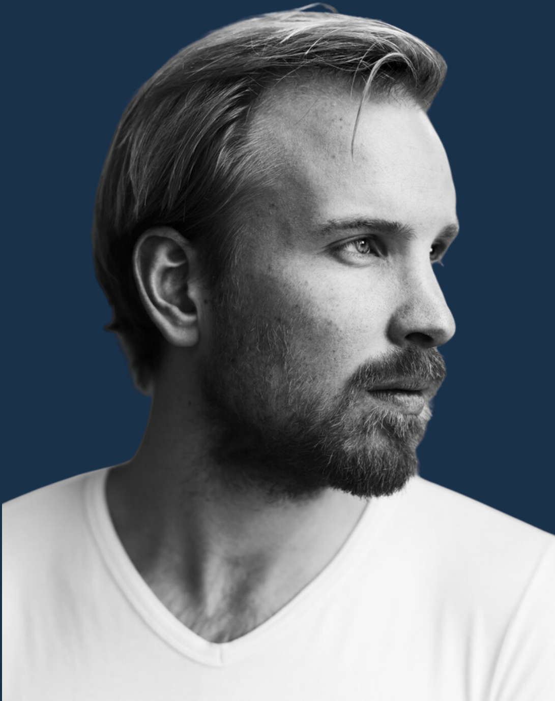
RUTGER BREGMAN HISTORIAN & AUTHOR

Rutger Bregman (1988) is a historian and author. He has published five books on history, philosophy, and economics.